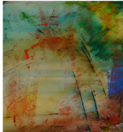
Artist: Eva Dillner Showing at Indigo Fusion Spa & Gallery

Indigo Fusion Spa & Gallery (206) 910-6460